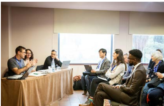
Sharing and caring: The heart of the matter