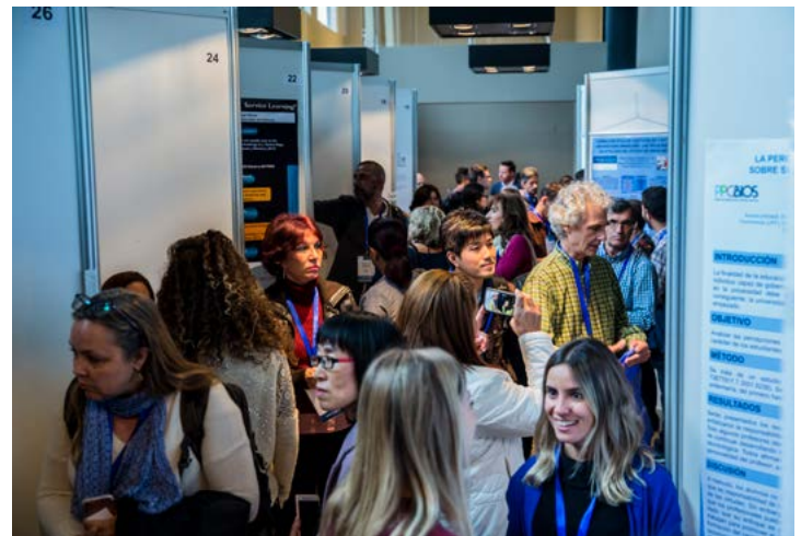
Packed-in at the Poster Session: People and Wisdom