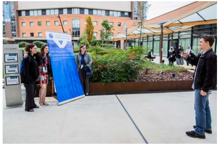
Young and proud AMERs making memories