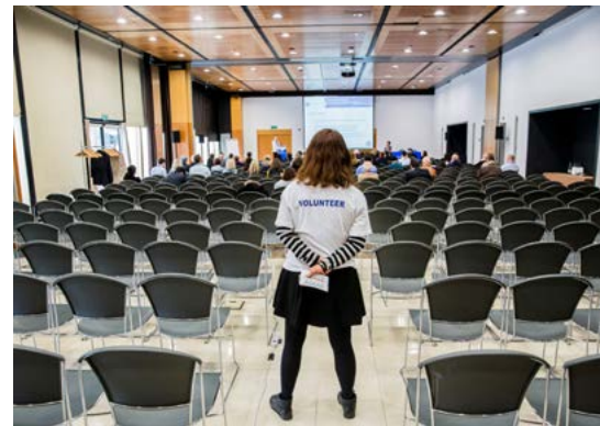
A special thanks to all our volunteers!